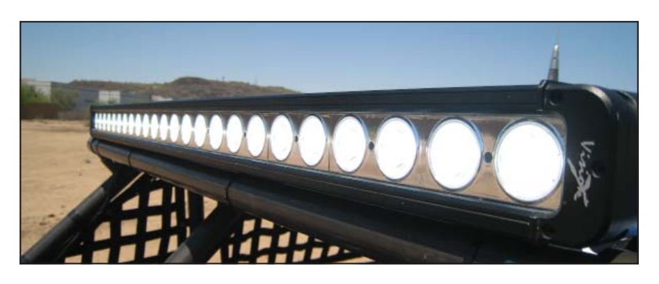
TIP: For complete application guide see website

TIP: Vision X recommends the use of liquid thread-locker, or Loctite, to ensure that every bolt and nut are safely secured.