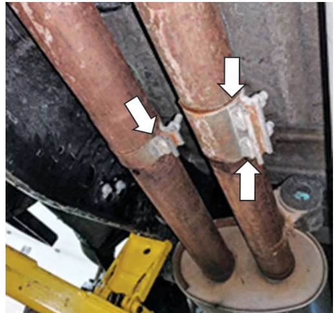
Front of vehicle